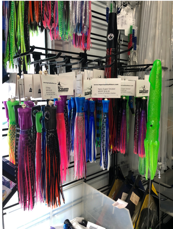
Photo: Shore Tackle and Custom Rods is located here.

Those who are looking for multi-day experiences may also charter a vessel that originates from our waterfront. Boaters can easily access to the Chesapeake Bay, one of the finest cruising areas in the world. C&C Charters, based in Kent Narrows offers a fleet of vessels for charter. Choose from: motor yachts, express cruisers, trawlers, sailboats and catamarans.